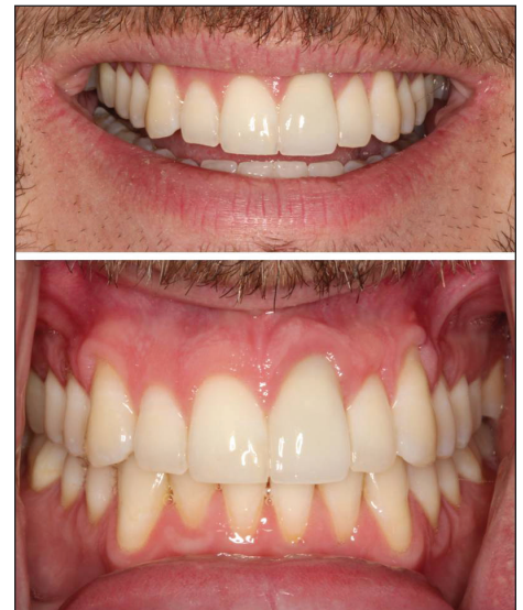
Figure 4. Final results—new crown on central incisor.