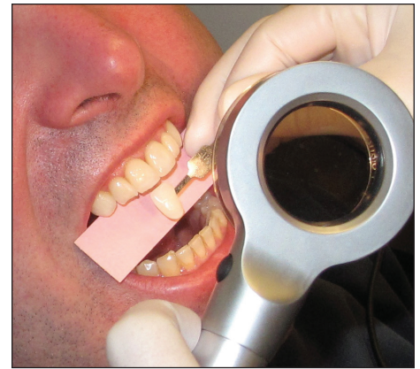
Figure 2. Handheld Rite-Lite2 HI CRI Shade Matching Light (AdDent).