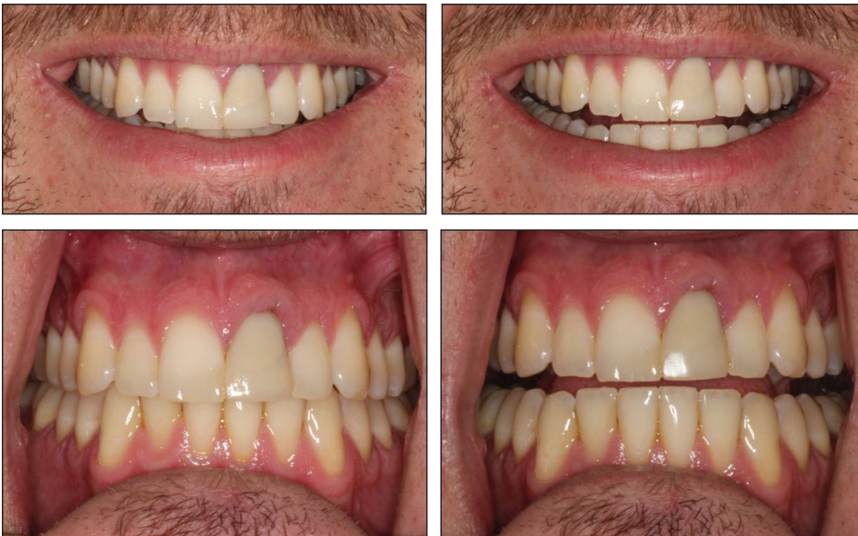
Figure 1. Pre-op photos of mismatched crown on nonvital central incisor with gingival inflammation.